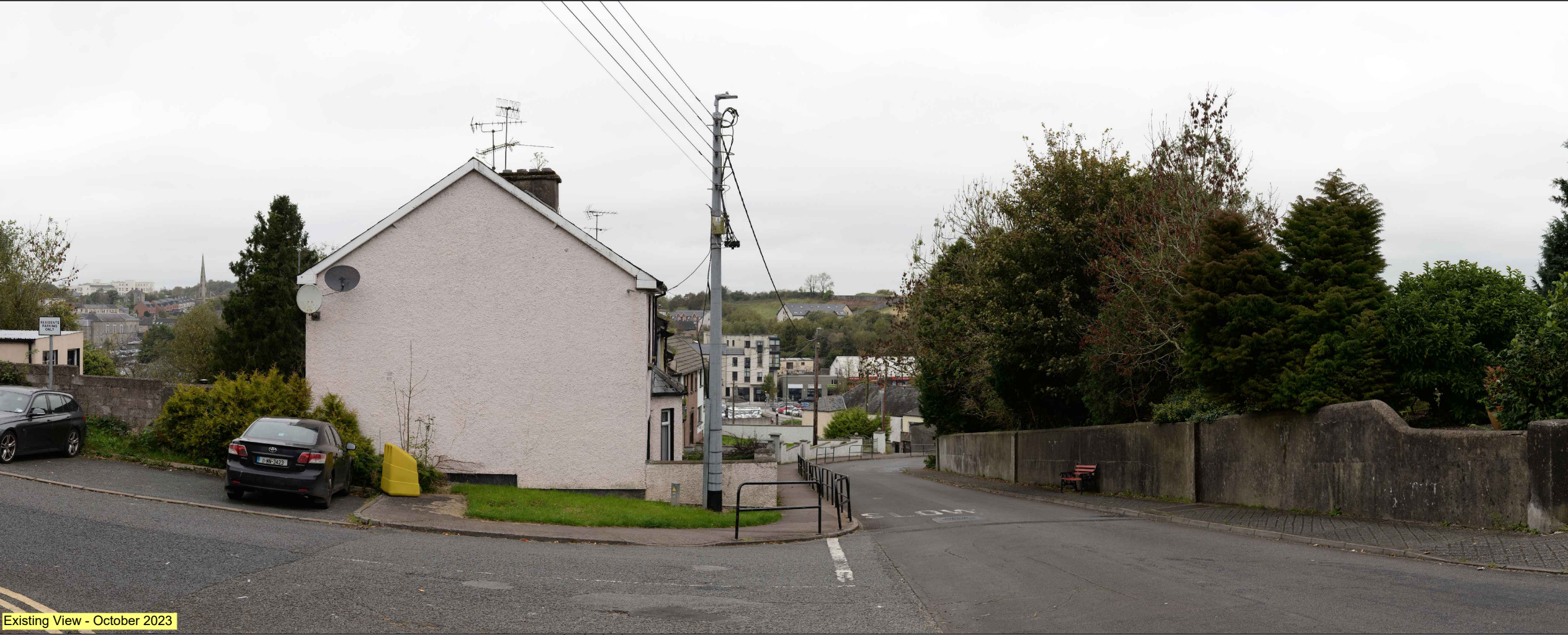
Existing View - October 2023

\\slr-local\au\Offices\IE\Dublin\SLR Data\SLR Projects\130570 Optimised Environments\Ltd\005_V14\35.DSN\DWG\14.2-3 PM A.G.dwg 29/11/2024