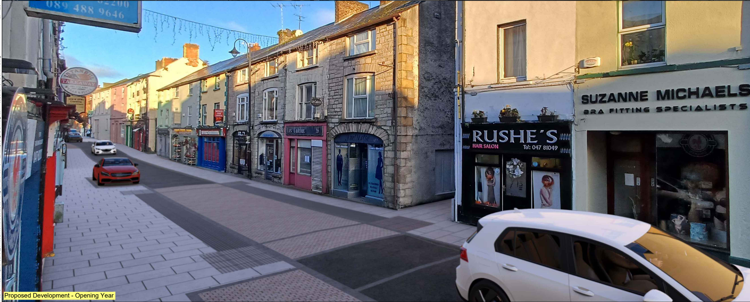
Proposed Development - Opening Year

Grid Coordinates (ITM): 667314:833722 Direction of View: North-west Distance from Site: 0m Horizontal field of view: N/A Camera: Samsung Galaxy A34 Lens: N/A Camera height: c. 2m Date and time: 26/11/2024 @ 09:45