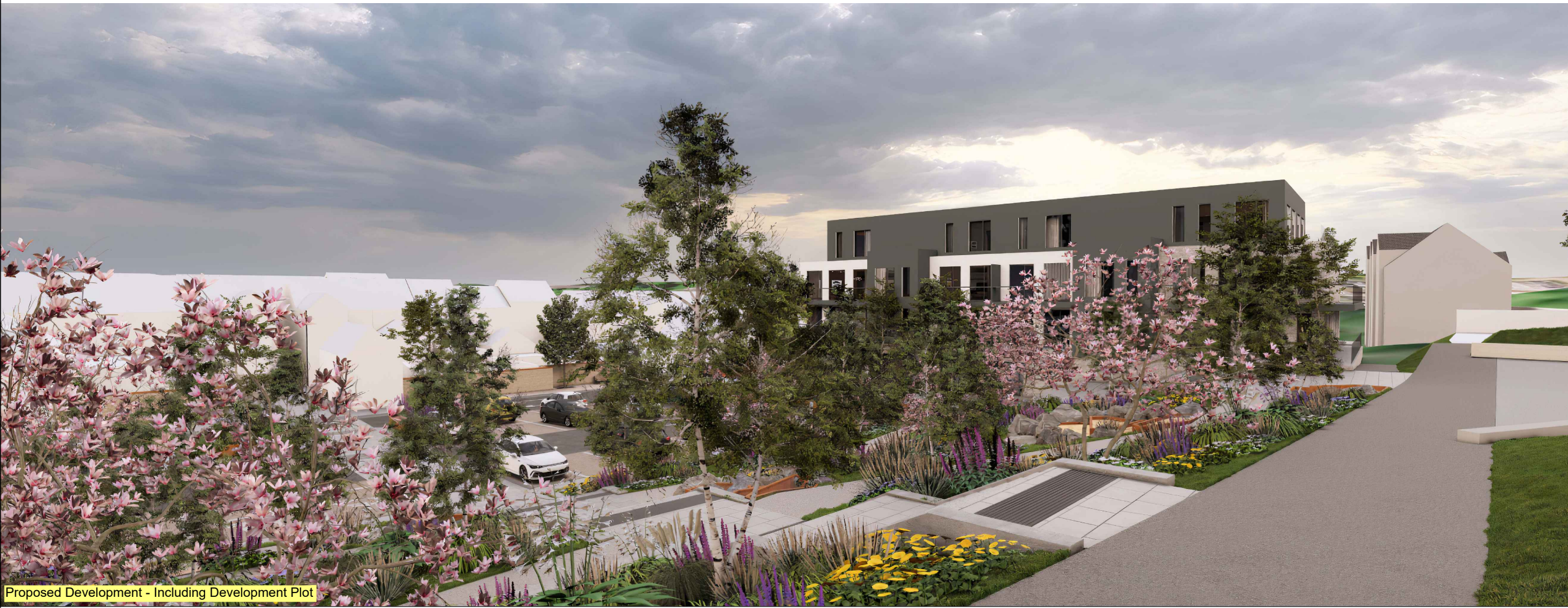
Proposed Development - Including Development Plot

Grid Coordinates (ITM): 667409:833762 Direction of View: West Distance from Site: 5m Horizontal field of view: 104° Camera: Nikon D610 Lens: 50mm f/1.8 Camera height: 1.5 m Date and time: 10/10/2023 @ 14:30