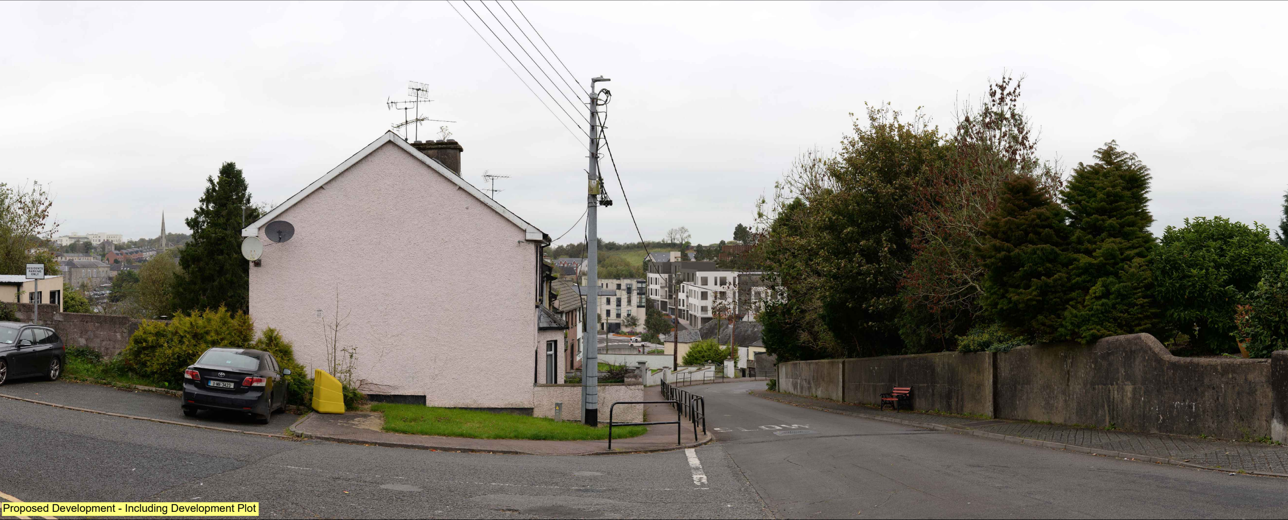
Proposed Development - Including Development Plot

Grid Coordinates (ITM): 667472:833438 Direction of View: North Distance from Site: 150m Horizontal field of view: 100° Camera: Nikon D610 Lens: 50mm f/1.8 Camera height: 1.5 m Date and time: 10/10/2023 @ 15:05