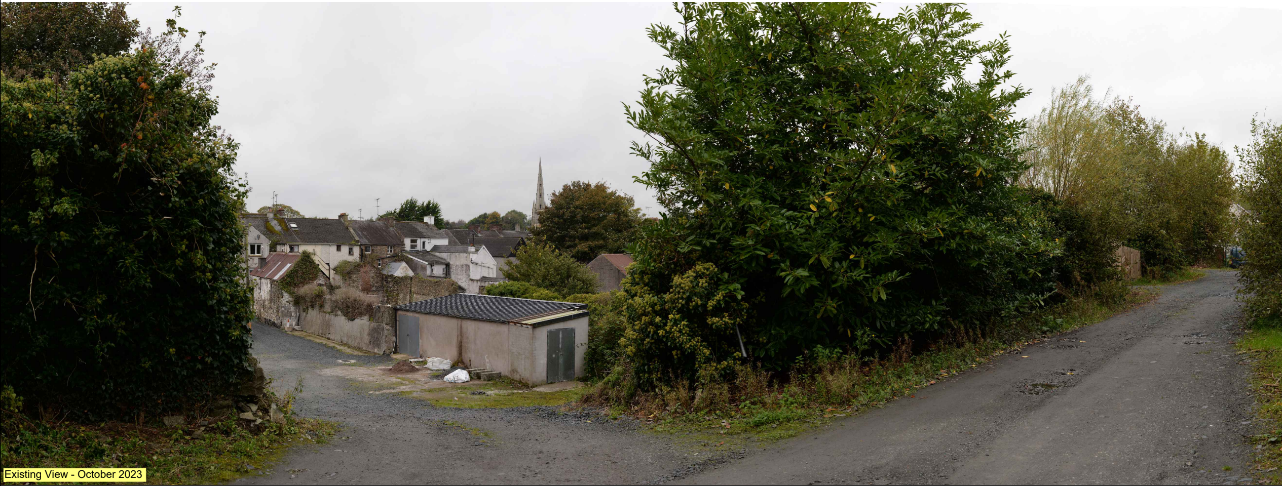
Existing View - October 2023