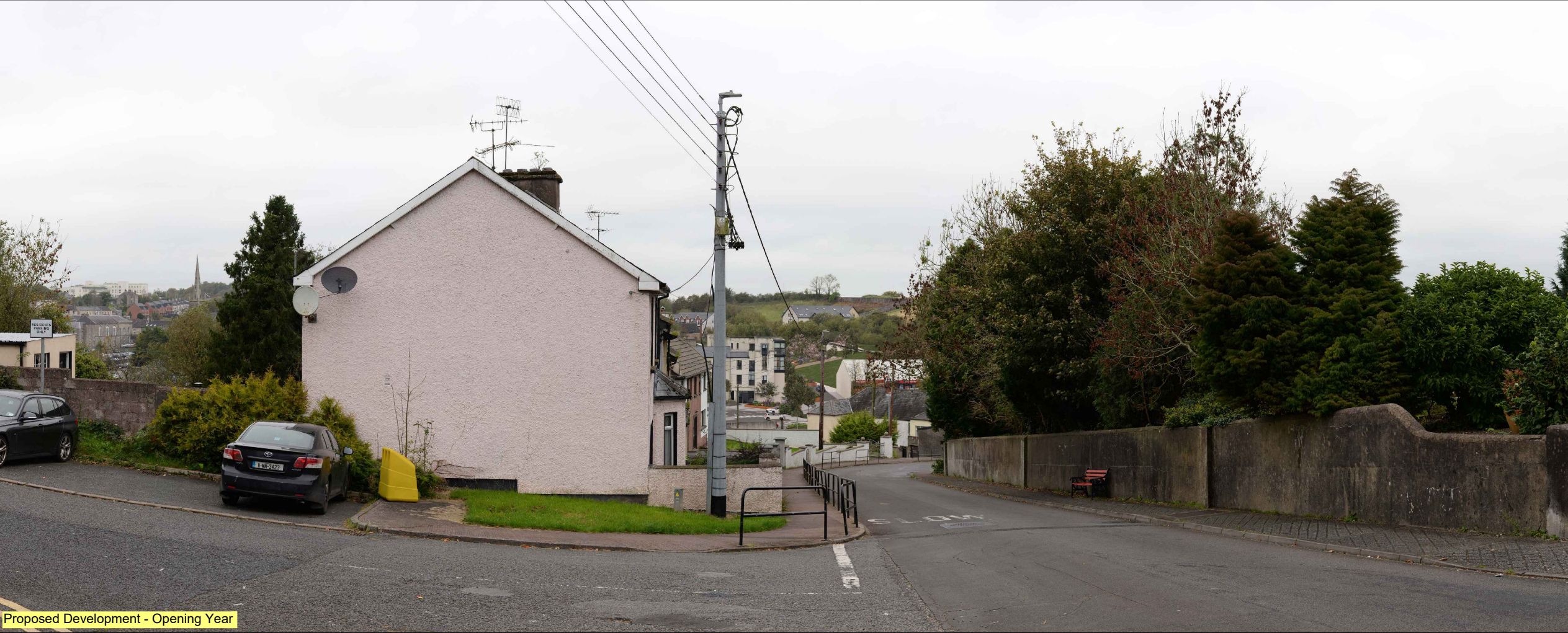
Proposed Development - Opening Year

Grid Coordinates (ITM): 667472:833438 Direction of View: North Distance from Site: 150m Horizontal field of view: 100° Camera: Nikon D610 Lens: 50mm f/1.8 Camera height: 1.5 m Date and time: 10/10/2023 @ 15:05