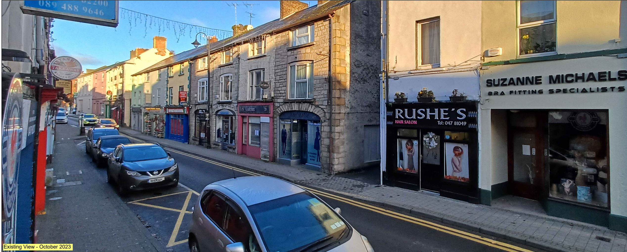
Existing View - October 2023